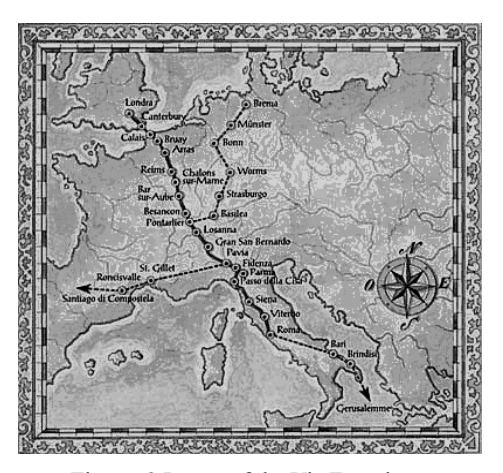
Figure. 2 Image of the Via Francigena

In the Golden Age of Siena's Medieval Period a number of volunteer institutions were founded of which the most important are the Hospital Santa Maria della Scala (founded in 1090) and the Arciconfraternita della Misericordia (1250), which provided services to pilgrims and citizens alike.