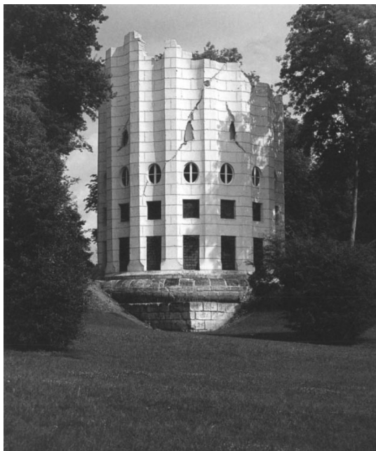
Figure 1. Broken Column in Desert de Retz