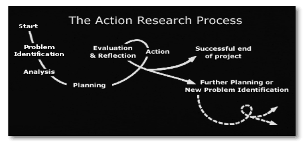
Figure 4. The Action Research Cycle