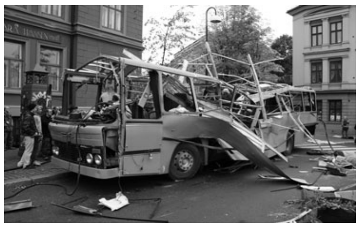
Figure 1. Photo of bombed-out bus

Exercise Oslo 2006 is Norway's civilian-led crisis simulation. The exercise, a respose to the events of 9/11 and terrorist attacks in Madrid and London in 2004-2005, is analyzed here using the frameworks of crisis communication. Based on participant observation and interviews, the author evaluates the experience and recommends applications for future media game exercises.