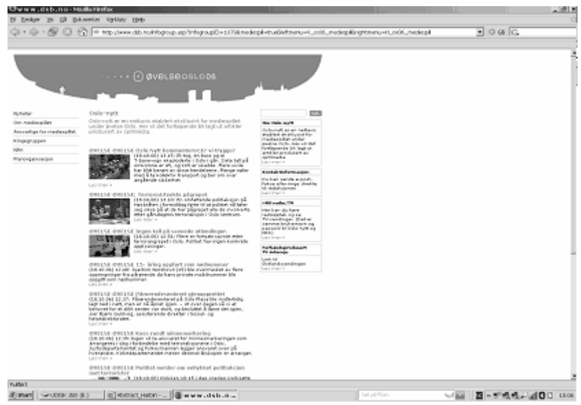
Figure 3. Front page of Oslo News

The five embassies (UK, Denmark, Finland, Iceland, Pakistan) involved themselves as far as their own citizens were concerned, but they were in many cases not able to respond optimally to the media due to lack of information from Norwegian authorities.