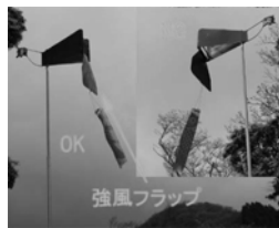
karakuri kazami 16

The term karakuri kazami is probably even more unusual in Japanese than whirligig duck in English (only appearing once in Google), but karakuri indicates clever mechanical movement, and kazami is a windvane; thus the term itself has a similar unfamiliarity for the reader, and yet the imagination immediately joins the two parts and comes up with a fairly accurate mental image of something rural, mechanical and moving in the wind. A more common Japanese term (such as kazamidori =weathercock) would simply not have had the same effect.