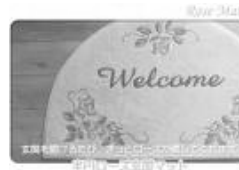
Genkan matto 18

Although many Japanese homes do have what is called a genkan matto , and many of these do indeed sport the word “welcome” in English, its function is different from the American doormat, which not only welcomes and decorates but is also used to wipe outside dirt and dust from shoes before entering the home. The placement of the genkan matto is generally within the home inside the front hall, rather than outside. Thus the doormat cannot be snowed upon, and there is no corresponding term in the Japanese translation. The WELCOME, however, could belong to some other outdoor decoration typical in Japan, such as a garden imp statue or outdoor wall hanging.