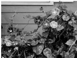
morning glories 21