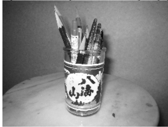
Figure 1: A Sake Cup for a Pencil Stand