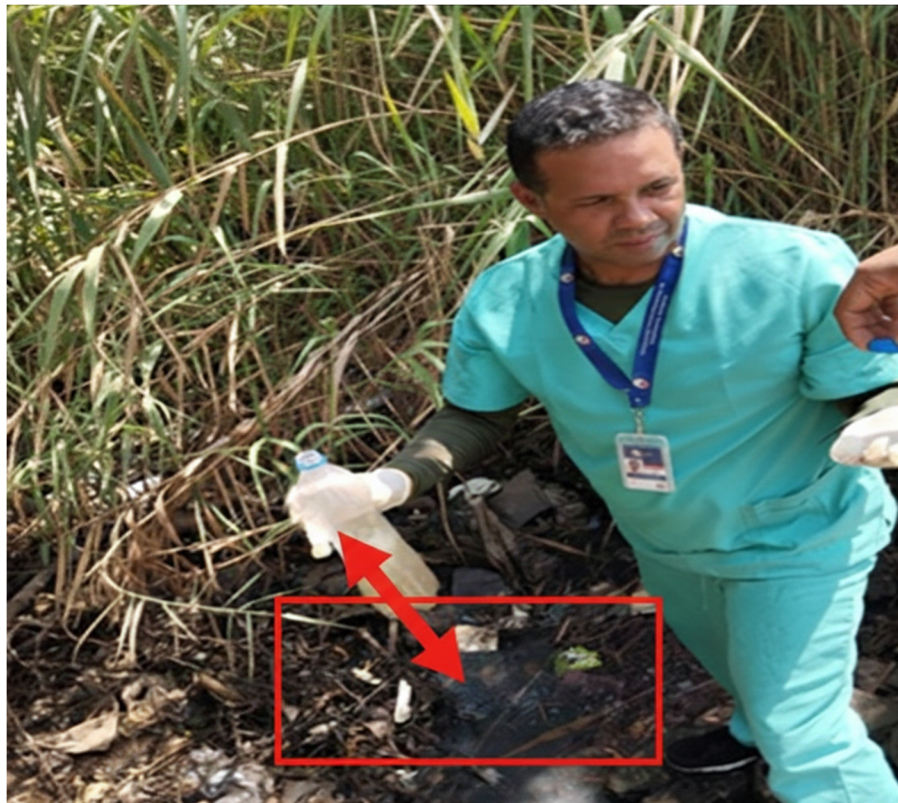
Figure 1. Identification of larval habitats in a mangrove wetland. La Marina Park, Maracaibo Metropolitan Area, Venezuela. The image highlights the lower central pool (main larval habitat) with a red arrow and dotted box, where the larval sample was collected. This type of stagnant pool, characterized by shallow water (<20 cm), mud, plant debris, and emergent vegetation, represents a typical breeding ground for mosquito vector species in mangroves, which are characterized by variable salinity, low water circulation, and high organic matter content.