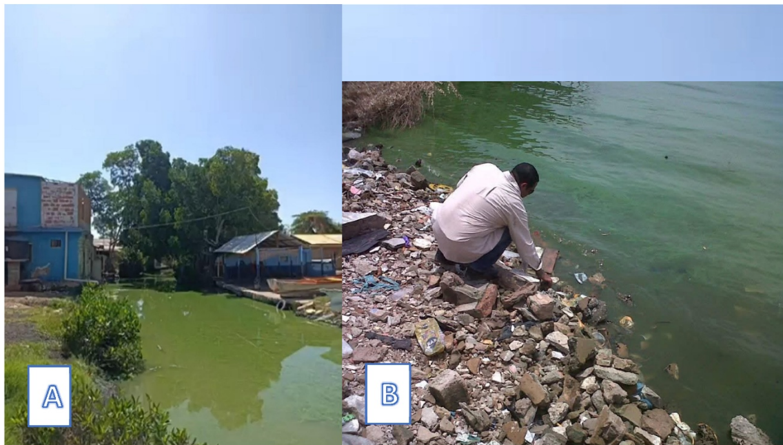
Figure 2. Anthropization of mangroves in Santa Rosa de Agua, Maracaibo: Modified larval habitats. (A) Houses built directly on the mangrove, with stagnant greenish water invaded by urban structures, illustrate the conversion of coastal ecosystems into residential areas. This encroachment reduces the ecological resilience of mangroves, as described by [5]. (B) Sample collection in the Monte Cristo canal, where the turbid water with vegetation and debris forms ideal breeding grounds for Aedes aegypti and Culex quinquefasciatus , is favored by environmental degradation [8,13]. Additionally, the image supports the intermediate disturbance hypothesis in anthropized wetlands, where urban invasion alters food webs and promotes opportunistic vectors in microhabitats such as polluted puddles.

This scenario aligns with descriptions from those who note that converting mangroves to urban or industrial areas significantly reduces their ecological resilience [5]. In Maracaibo, the reduction in mangrove areas has been accompanied by a documented increase in the populations of Aedes aegypti and Culex quinquefasciatus , favoured by the microenvironments created by environmental degradation [4,6] (Figure 2).